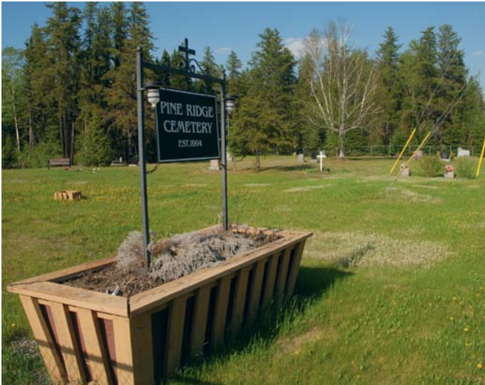
The Chief & Council are being proactive regarding winter burials in the graveyard at Pickle Lake.