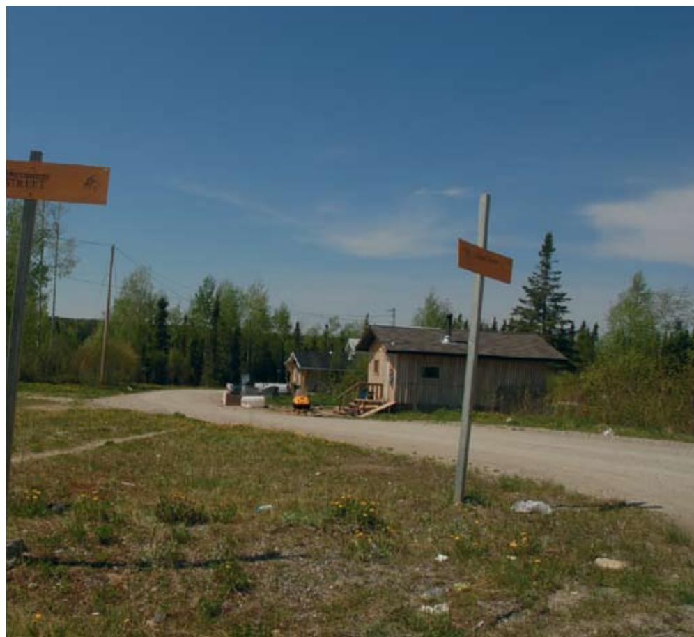
The need for housing maintenance and new housing has band council and administration thinking "outside the box."

NAPS, the on-reserve police force, is jointly funded by the federal and provincial governments. In Mishkeegogamang, NAPS currently has a full complement of six officers and has just acquired a third cruiser. The OPP, a legislated entity based in Pickle Lake, has 12 officers and a sergeant. The OPP assists NAPS and polices Highway 599 and the off-reserve and "unorganized" reserve areas, such as Mile 50.