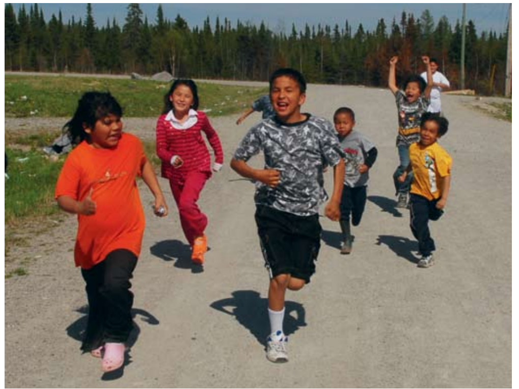
Watch out for young people playing and walking/running along the road, especially if they are wearing dark clothing at night.