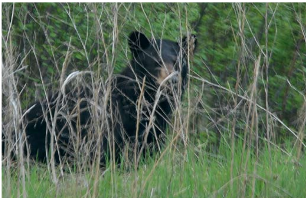
The police are warning people to be on the lookout for bears in the community.