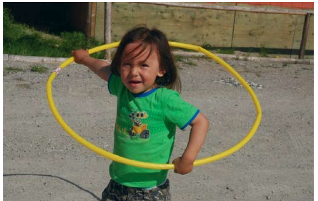
Summer is here and with it comes opportunities for a variety of outdoor activities.

Another summer project involves the construction of a new road around the gravel pit as well as general reserve road maintenance.