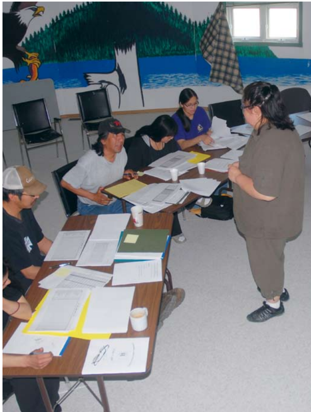
The program managers had a three day training to assist them with financial planning and accountability.

The goals for the future include a vision for jobs and a healthy environment, with youth doing their best in everything they do. The dreams of the presenters are for more cultural activities, the telling of more stories about the past and encouragement for healing among the youth "so that we can have a strong sense of identity as First Nations peoples."