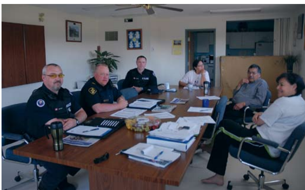
Representatives from the OPP and NAPS meet with Chief and Council on a monthly basis to discuss areas of concern.