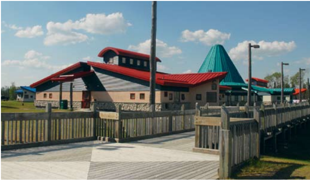
There are three grade 8 graduates from the school in Mishkeegogamang.