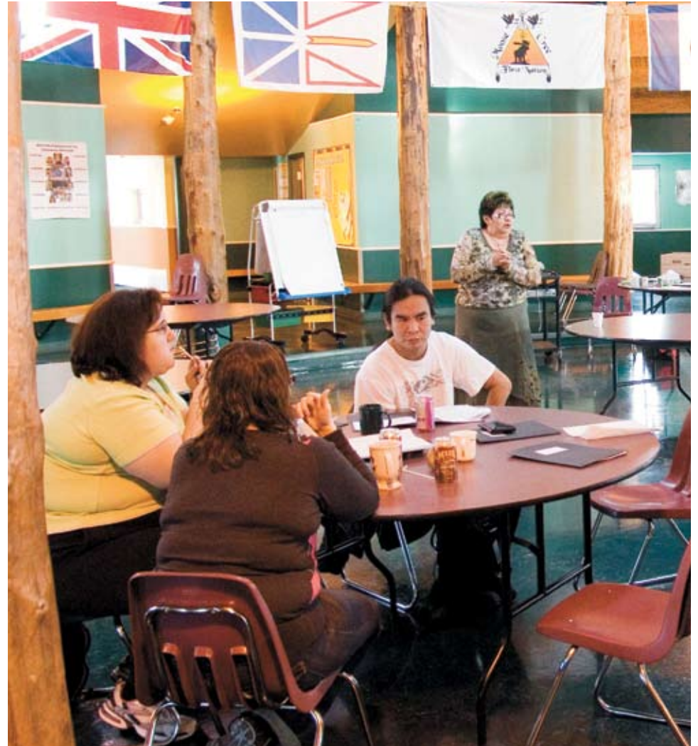
Participants at the Lateral Violence seminar held at the school.

Telemedicine reduces the high cost of travel and the stress that community members often feel when they travel to a foreign environment where the culture and language are different. First Nations also benefit from telemedicine during the flu season, when they can use it to share updates and keep informed of outbreaks.