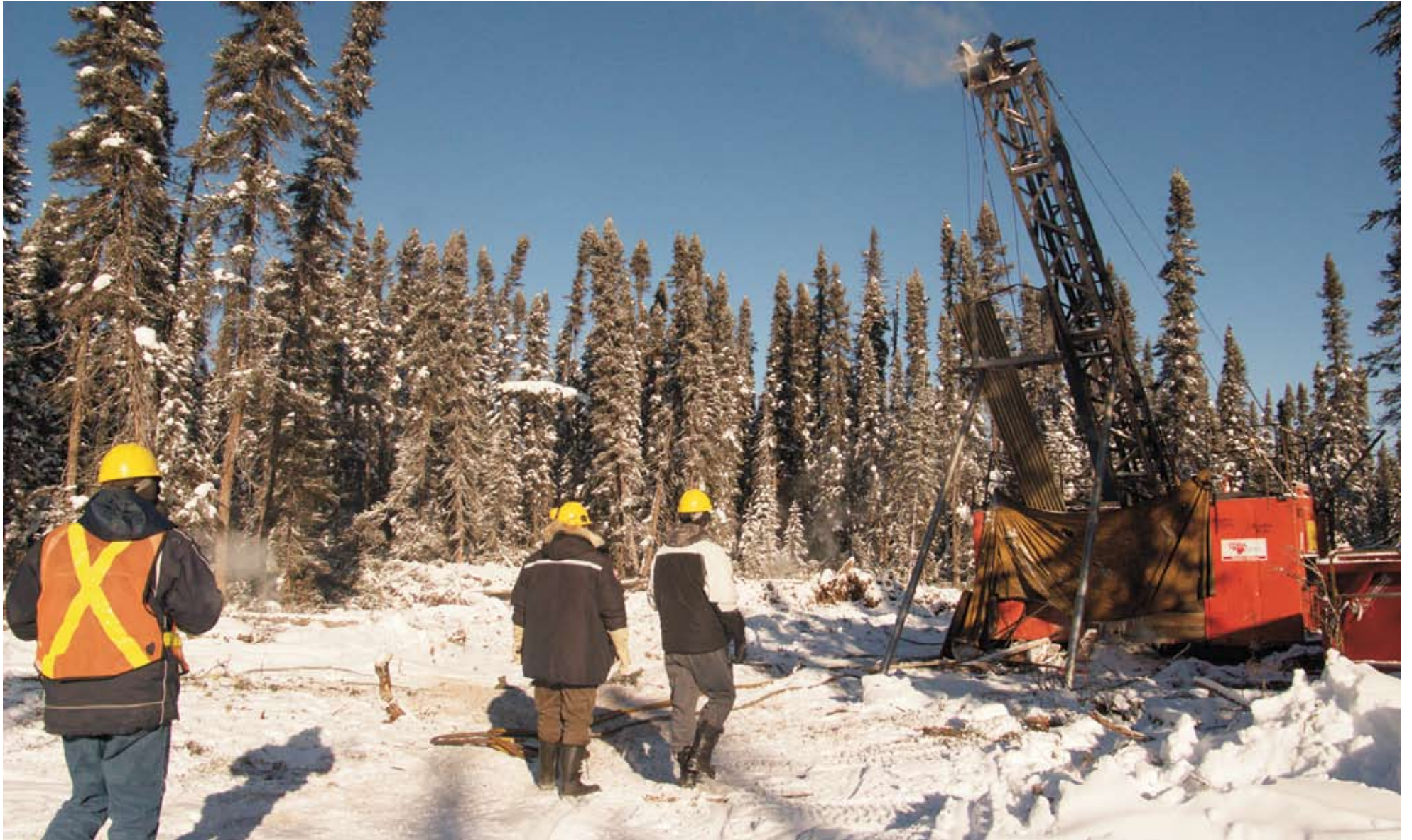
A PC Gold drilling rig in the bush near Pickle Lake.