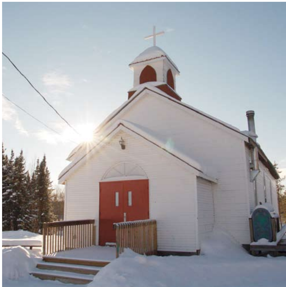
Sunday meetings will now start at 11 a.m. at the Bible Baptist Church.