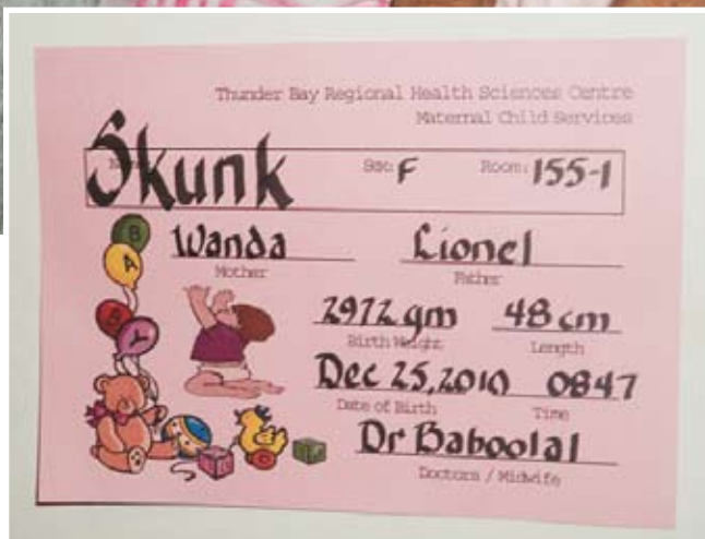
Christmas baby Lynane was born at 8:47 on Christmas morning to proud parents Wanda and Lionel Skunk. She weighed 6 lb 8 oz.