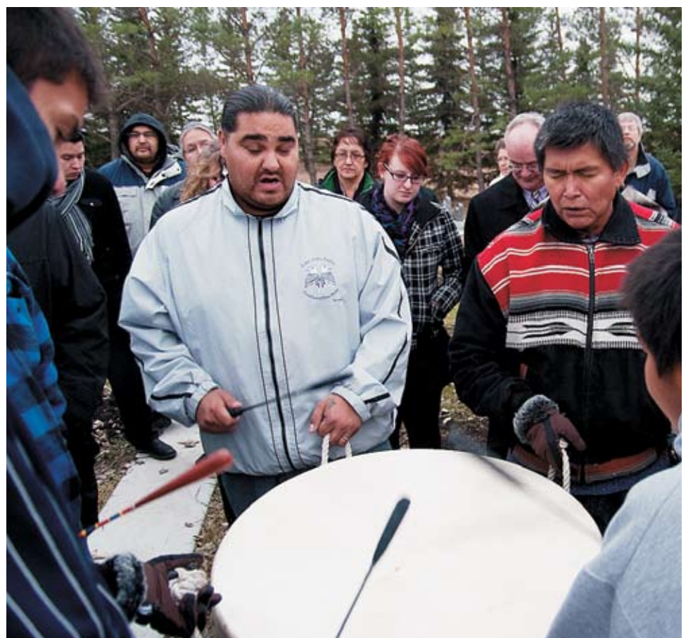
Drummers from Roseau River Anishinabe First Nation at the graveside.

I thought about what it was about her that made [what she did in the community] work so well. Even for the most controversial issues, she took a can of worms and sorted them out to come up with the facts that represented the story in the fairest way possible. More importantly, through the newspaper and through her work, a long-lost voice of individuals and a people was starting to have a place to talk. I miss her positive attitude and outlook and the variety of stories that she did.